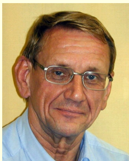
by Bjarne Holmbom

Finland has been a forerunner along this path. Well known products such as tall oil, xylitol and Benecol were originally developed in Finland. We do not have any oil or coal, but have more biomass per capita in the form of wood than any other country in the world. We must use our "green gold" wisely. Polysaccharides, fatty and resin acids and polyphenols can be extracted from wood, bark or industrial process streams and can be utilised for new materials and chemicals that cannot be synthesized by chemists, at least not as elegantly as by nature. New biomass-derived products will not be replacing bulk products, but will be small-scale niche products where the profit margins may be very healthy, thanks to help from nature.